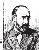
GEORGES BARRERE FLUTE

May 21, 2000 • Sunday 3:00 pm ENSEMBLE PROGRAM CONCERT at the Kaplan Space at Carnegie Hall