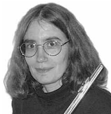
From the Editor

All concerts and events (except as noted) at Yamaha Piano Salon, 689 Fifth Avenue (entrance between Fifth and Madison on 54th Street). All dates and programs subject to change. Tickets $10, only at the door; free to members. For more information, visit the NYFC website at www.nyfluteclub.org or call 732-257-9082.