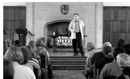
More Peter Schaaf photos on p. 7.