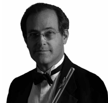
From the President

Well, another flute fair has come and gone. All in all, it was a successful event. We went back to one of our old places because LaGuardia High School was unavailable. I had forgotten how labyrinthine the Union Theological Seminary can be. It is a large building, and one wishes there was a piece of cheese waiting for you as the elevator opens to the Bonhoeffer Room.* On the other hand, I savor the old world charm of the place in general. When one thinks of the history of Western music, and how