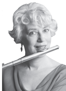
From the President