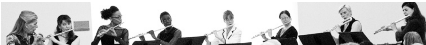
A performance of Katherine Hoover's Peace is the Way .