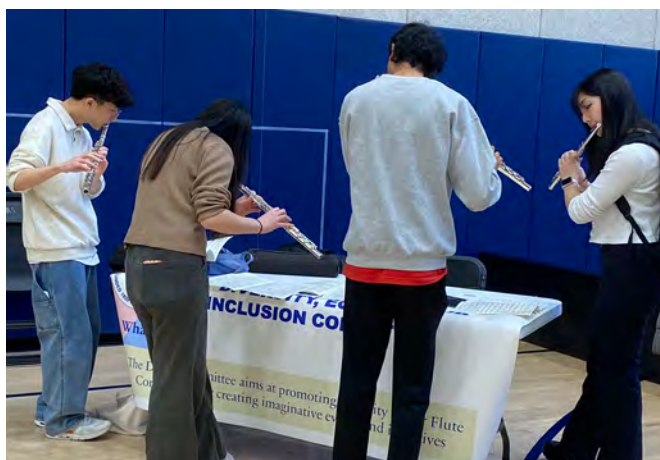
An impromptu quartet tries out music from the tag sale.