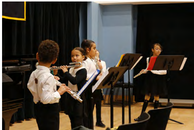
Aspiring—and adorable—young flutists warm up for their program.